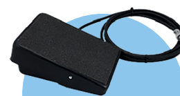
FOOT PEDAL AVAILABLE