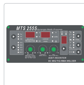
Digital Panel for Full Control