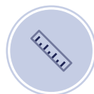
4.0mm Max Rod