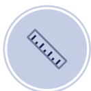
3.2mm Max Rod

The R-Tech Pro-Arc175 is lightweight and portable so ideal for maintenance and fabrication work. Comes with rugged case and lead set.