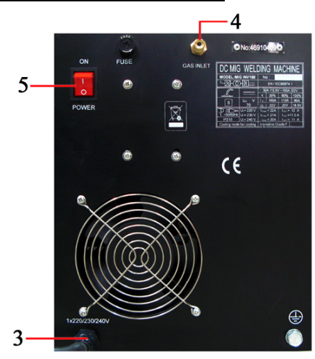
Fig 1 Fig 2